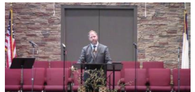
(Community Baptist, Canon City, CO)