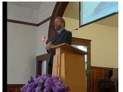
(Tabernacle Baptist, Roswell, NM)